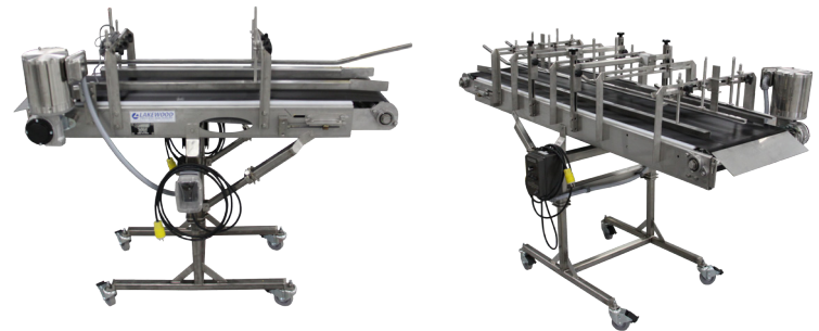
(Dual Lane Model)